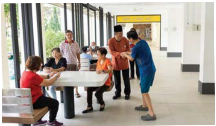
Blk 842 Neighbours' Hub