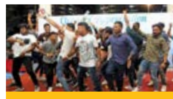
P11 Appreciating Our Cleaners