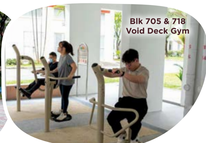
Blk 705 & 718 Void Deck Gym