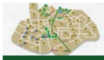
P8-9 Powering Tampines