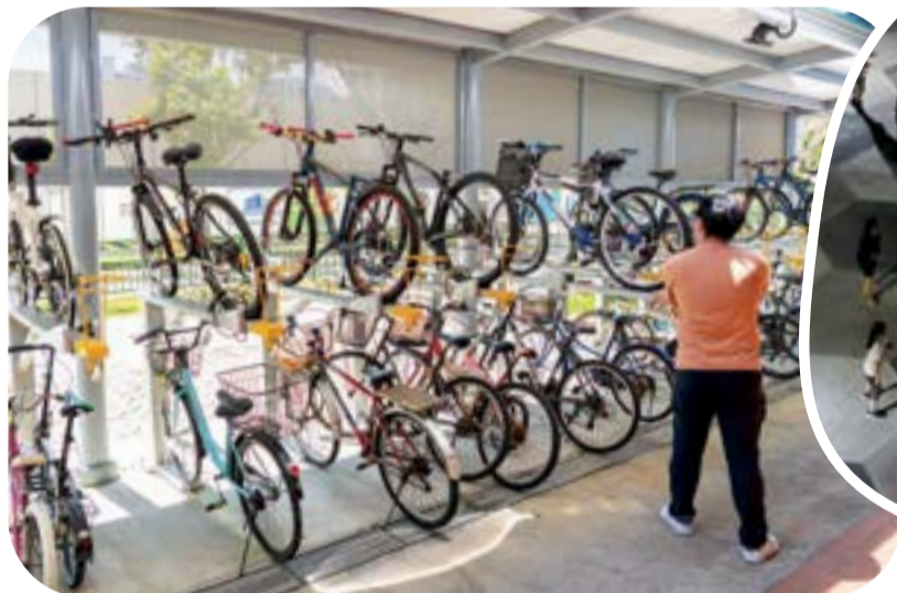
Blk 929 Sheltered Dual-stand Bicycle Rack