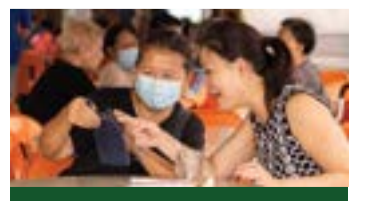
P15 Registration for LPA Talk and Tree Planting as One Tampines