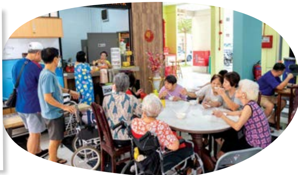
Blk 839 Residents' Corner