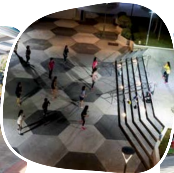
Blk 916 Hardcourt