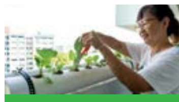
P7 Be a Corridor Farmer, Grow Your Own Food