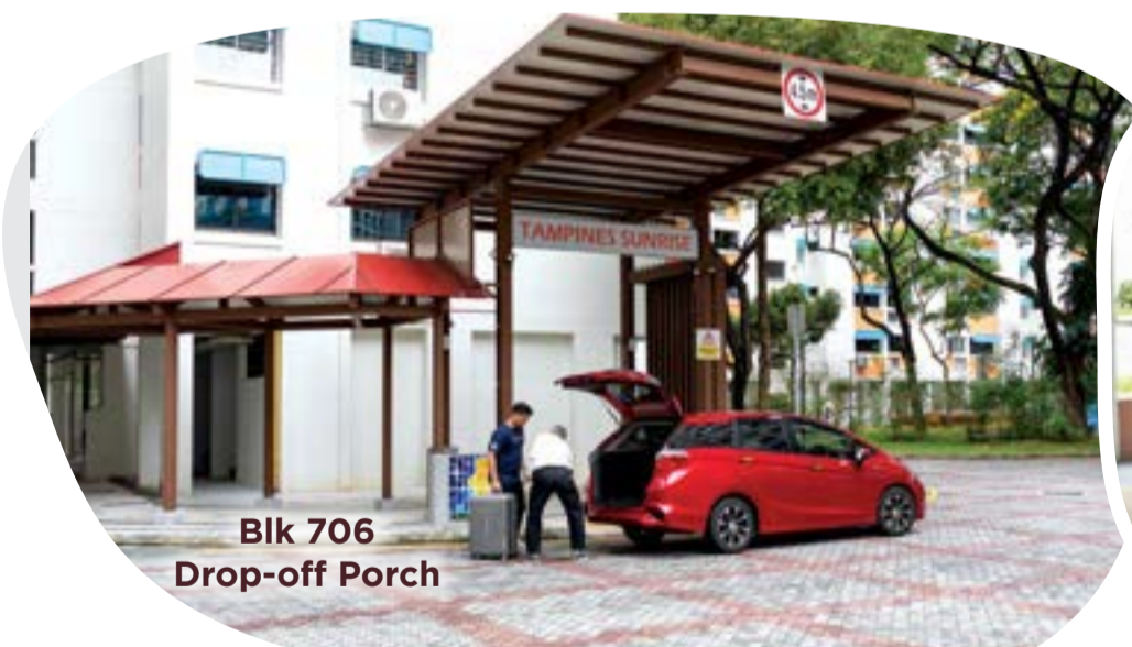
Blk 706 Drop-off Porch