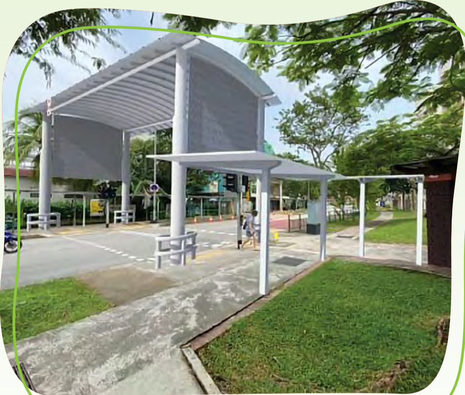
Sheltered Linkway Blk 207 to Chongzheng Primary School