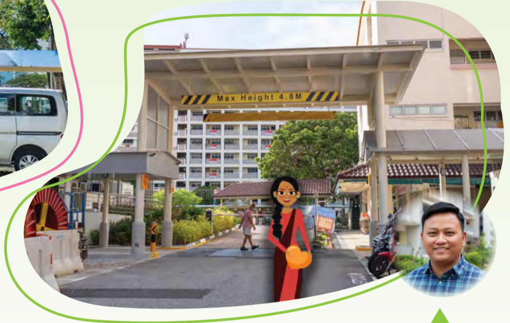
Sheltered Linkway Blk 201E to Tampines East CC