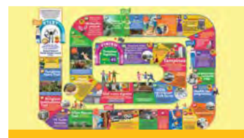
P8-9 A Town of Many Firsts Made-for-Tampines Board Game