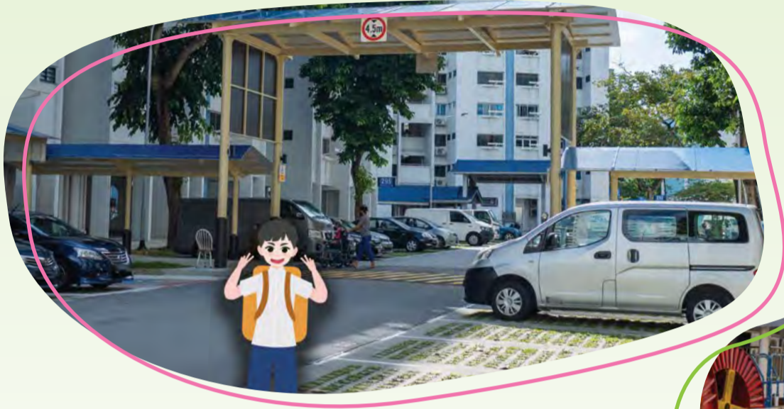
Sheltered Linkway Blk 293 to 295