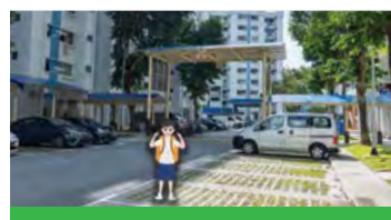
P3-4 Better Connectivity and Convenience