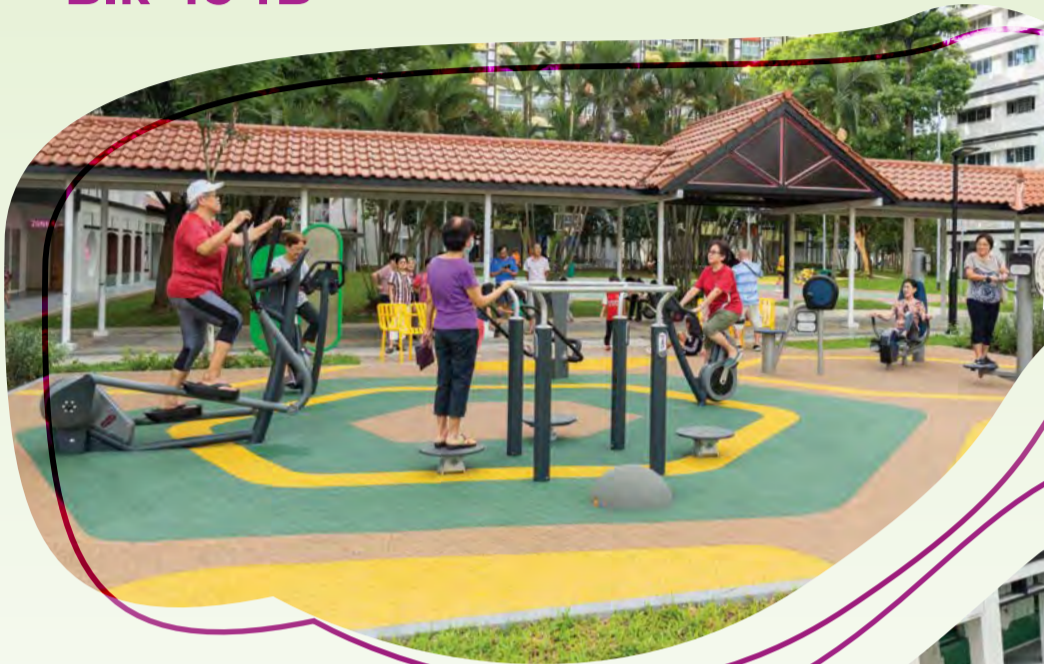
Fitness Corner Blk 494B