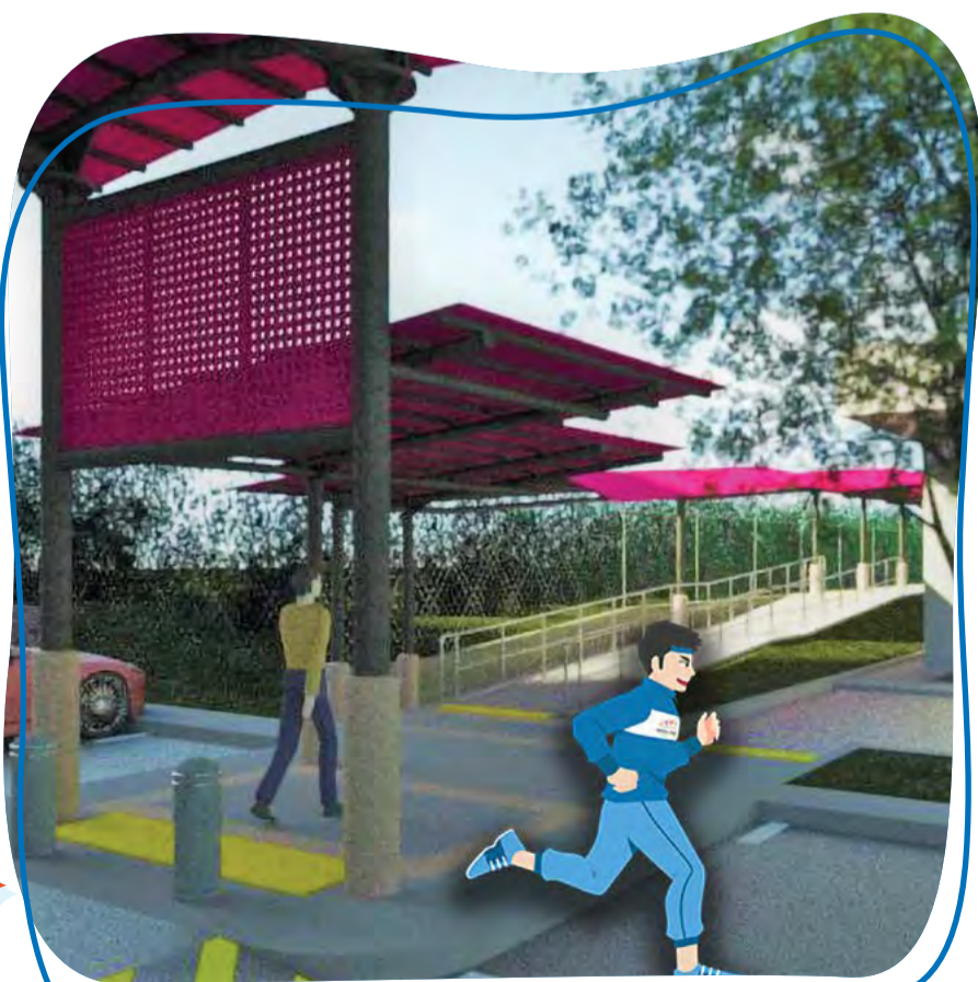
Sheltered Linkway Blk 150 to Tampines Primary School