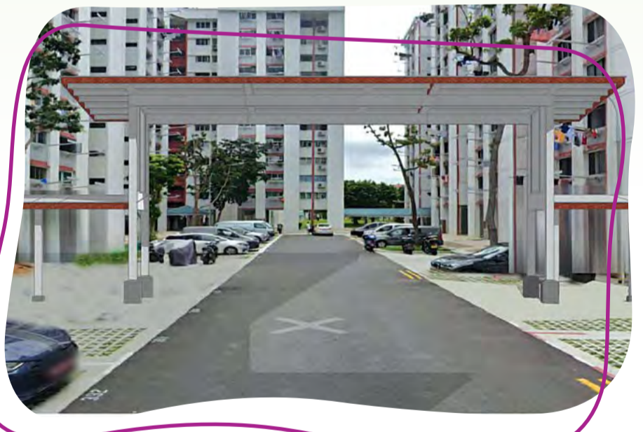
Sheltered Linkway Blk 416 to 417