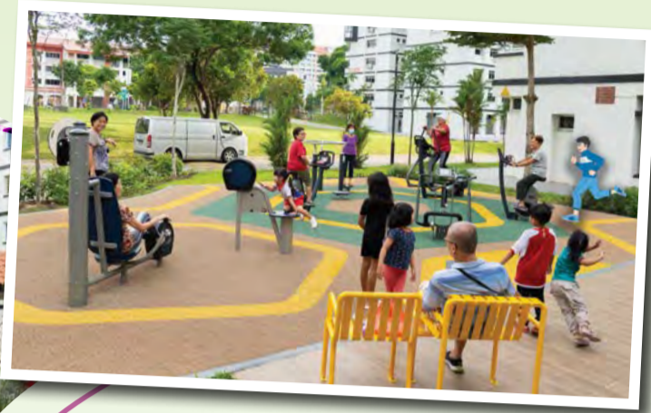
Playground Blk 493E