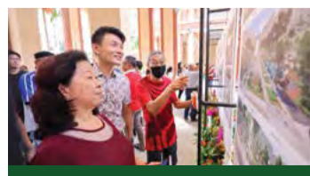
P5 A Facelift for an Iconic Estate