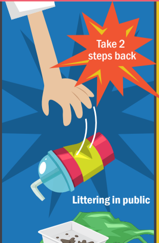
Littering in public