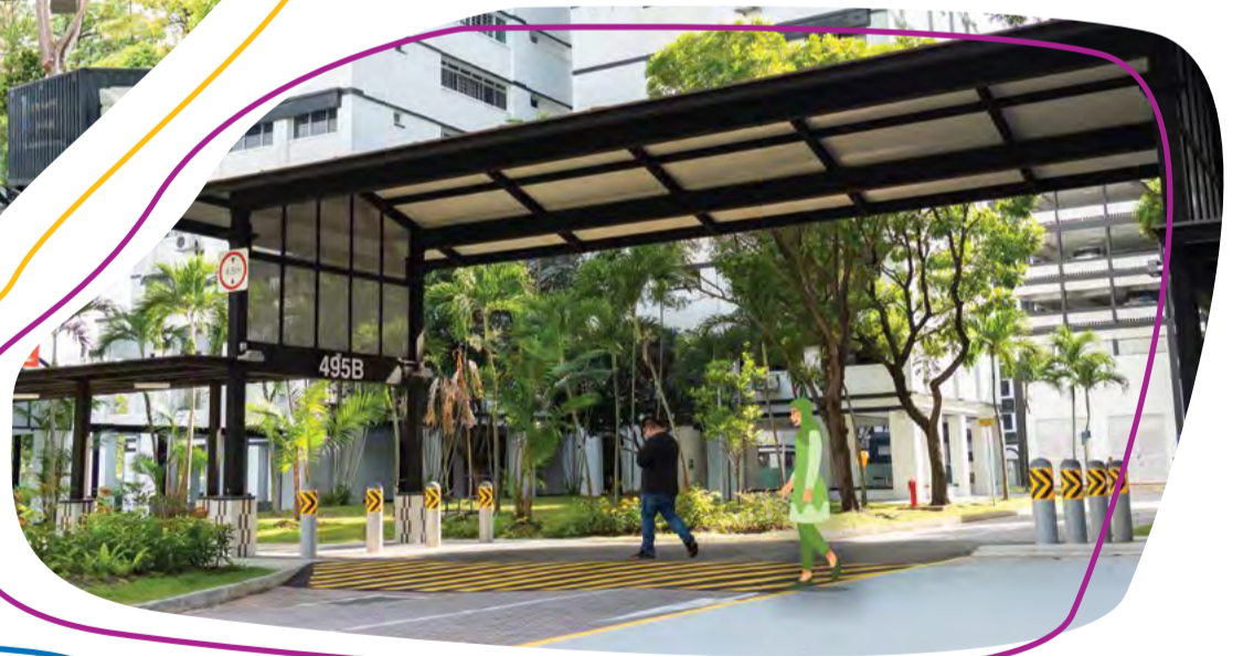
Sheltered Linkway Blk 495B to 495E