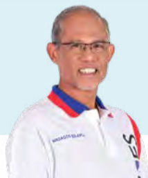
MR MASAGOS ZULKIFLI

நாடாளுமன்ற உறுப்பினர் சந்திப்பு அங்கம் மாத்தின் ஐந்தாவது திங்கட்கிழமையும் பொது விடுமுறை நாட்களும் தவிர்த்த மற்ற ஒவ்வொரு திங்கட்கிழமையும் நடத்தப்படும்.