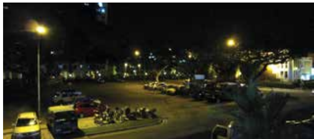
Before LED lights installation