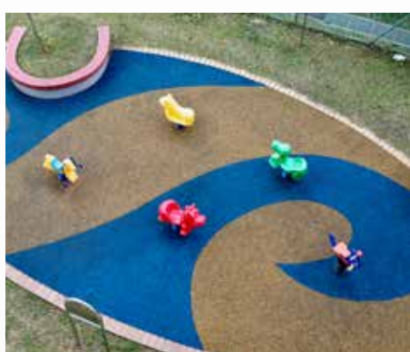
Upgrading of Playground and Fitness Corner - Block 424, Tampines Street 41