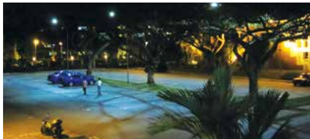
After LED lights installation

Tampines is now brighter as new Light Emitting Diode (LED) lights are being installed at HDB blocks, open spaces and car parks. The exceptional brightness is attributed to LED's distinct light distribution. Not only does this enhance the safety of our shared spaces, the switch from traditional light sources to LED is an effective means of reducing our carbon footprint.