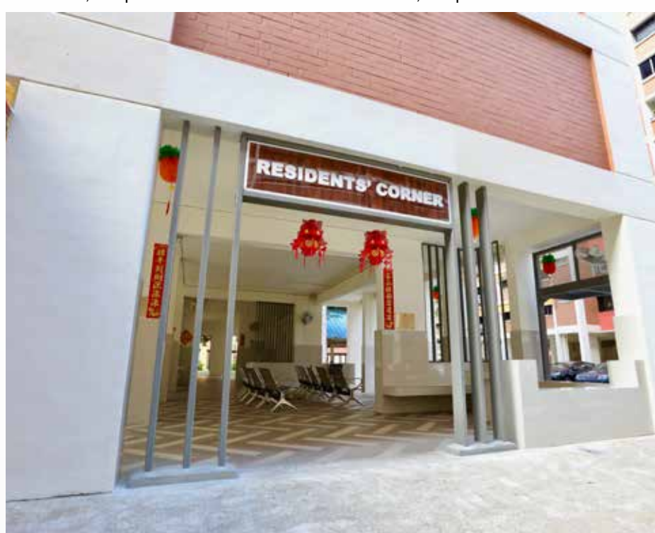
Upgrading of Senior Citizens Corner - Block 864A, Tampines Street 83