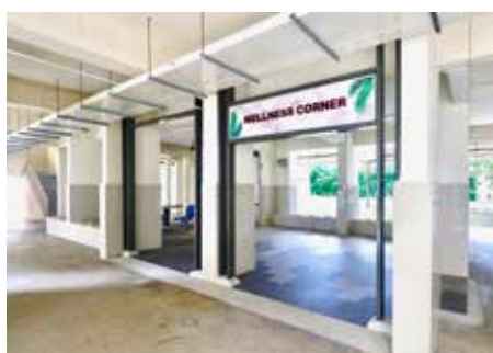
New Senior Citizens Corner - Block 145, Tampines Street 12