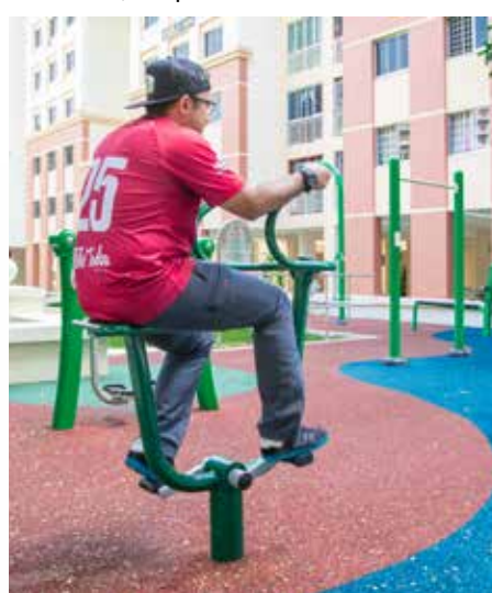
New Fitness Corner - Block 498J, Tampines Street 45