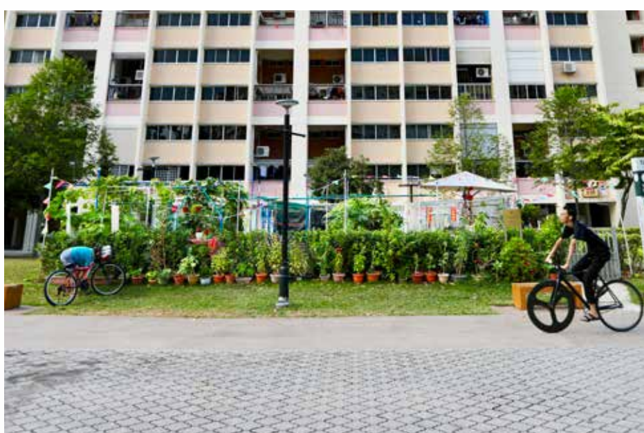
New Community Garden - Block 858, Tampines Avenue 5