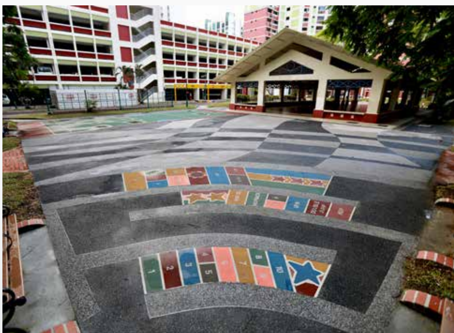
Upgrading of Hardcourt - Block 730, Tampines Street 71