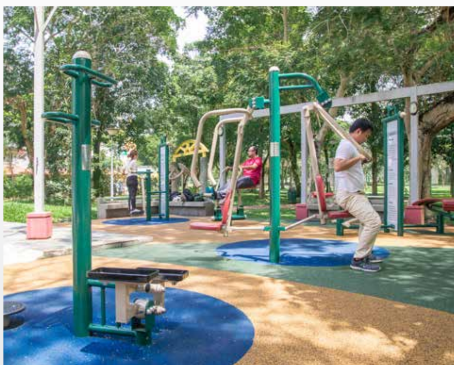
Upgrading of Fitness Corner - Block 408, Tampines Street 41