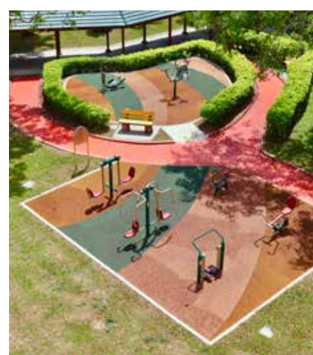
New Multi-Generation Fitness Corner - Block 267, Tampines Street 21