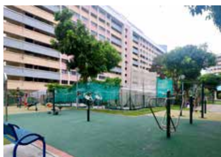
New Fitness Corner - Block 842, Tampines Street 82