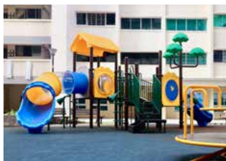
New Playground - Block 878, Tampines Avenue 8