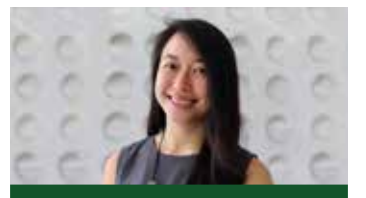
P15 The Little Things That Matter Big