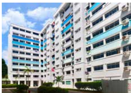
Painting - Block 324-331, Tampines Street 32 Block 338-340, Tampines Street 33