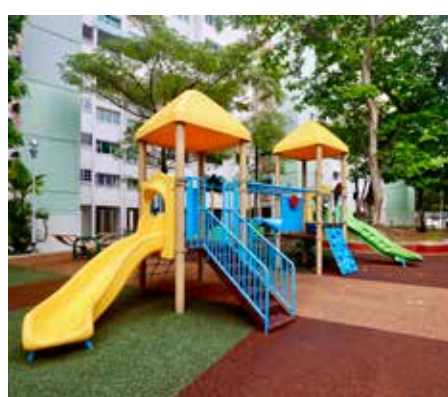
New Playground - Block 163, Tampines Street 12