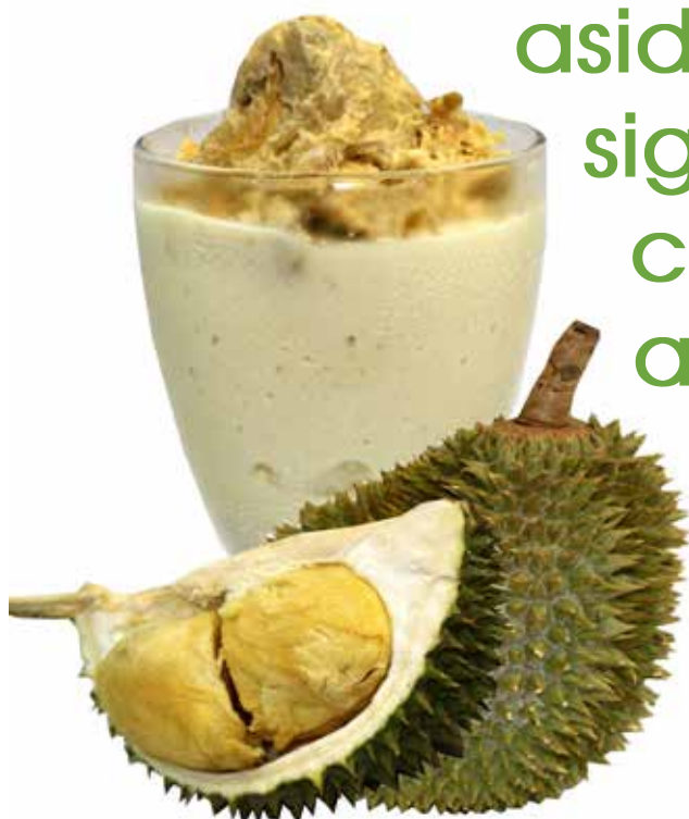
D24 Durian Smoothie

"Hot favourite among Tampines residents – the Durian smoothie – aside from the signature chendol and ice kacang"