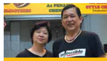
P14 Bonding Over Chendol