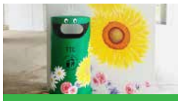
P4 Painting Our Environment Green