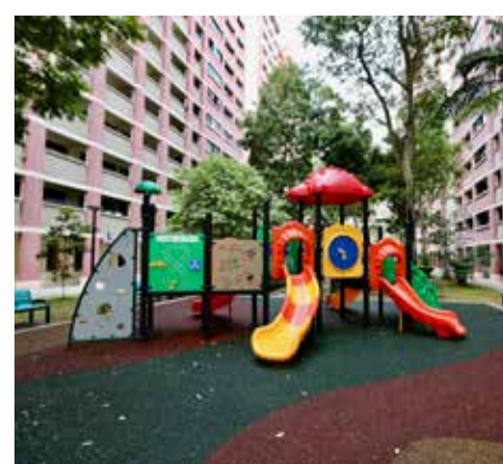
Upgrading of Playground - Block 707, Tampines Street 71