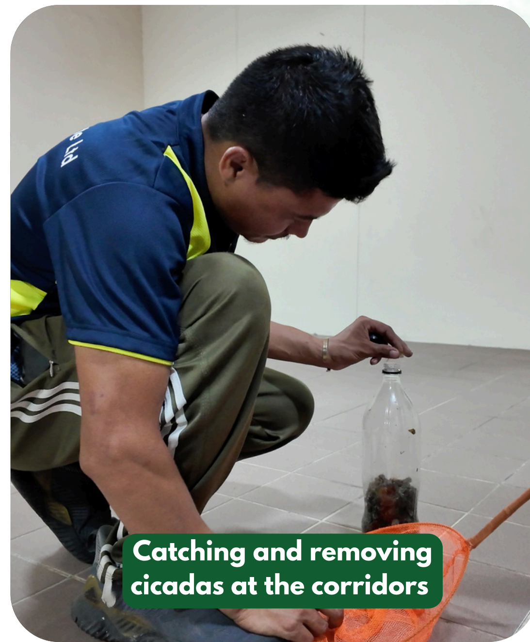
Catching and removing cicadas at the corridors