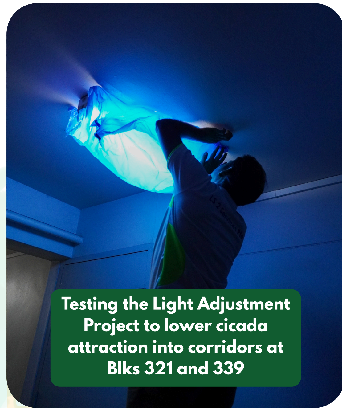
Testing the Light Adjustment Project to lower cicada attraction into corridors at Blks 321 and 339